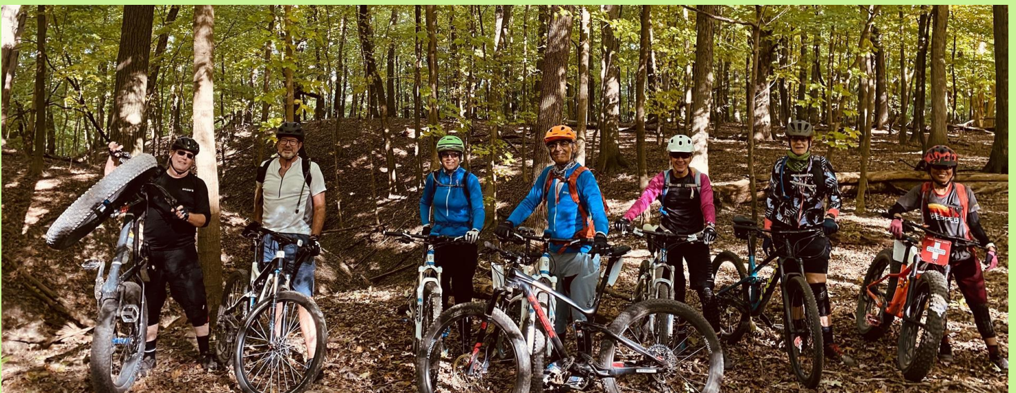
Palos Single Track Riders