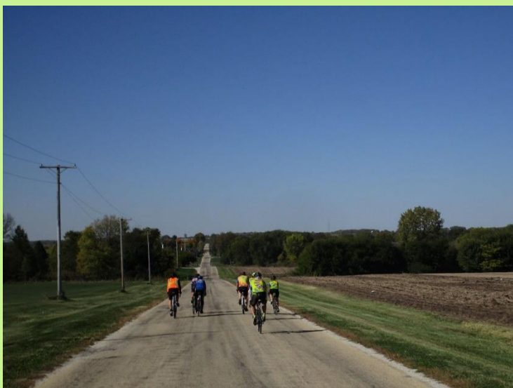
Trader Joe's to Oswego