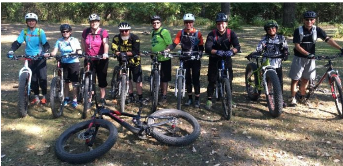
EBC Mountain Bikers are up for adventure at Wolf Road Woods, Palos Forest Preserve!