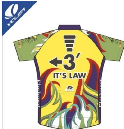
Back of jersey.