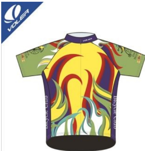
Front design, -