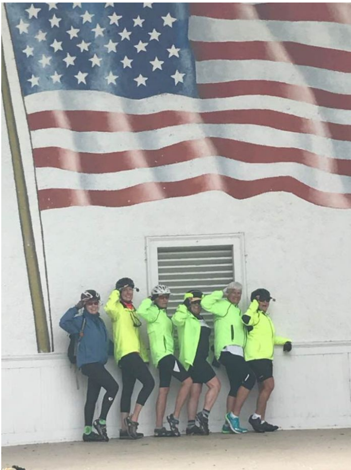
The Ladies Salute