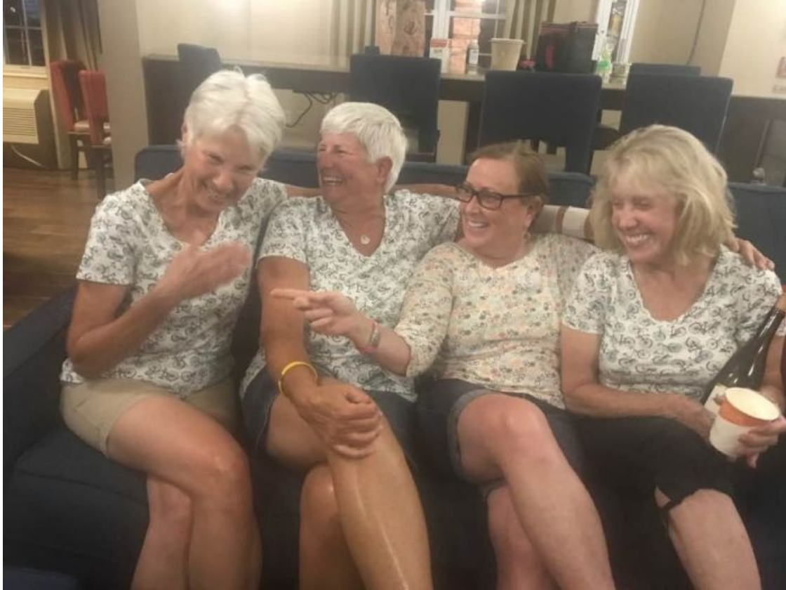
Too much fun! Are they all wearing the same top?

talking, laughing and carrying on. The ride to Milwaukee on the Ozaukee Interurban and Oak Leaf Trail was very enjoyable, passing through the beautiful Wisconsin countryside. We rode along the lakefront for a time and arrived at our restaurant stop just as it began raining again. We thought we were so lucky only to come out after the downpour to find all of our backpacks, bike bags, etc. drenched. We then headed out of Milwaukee and it started raining again with a vengeance. We put on our various rain gear and rode even though we could hardly see. We did stop at a little place that had an overhang that protected us for a time. Then we were off again. This was all worthwhile when we got to Cedarburg for homemade ice cream at Ashley's. We were amazed that the sun came out at that time...and we were almost dry when we arrived back at the Comfort Inn. Happy Hour was late this day due to the late start...but so very enjoyable.