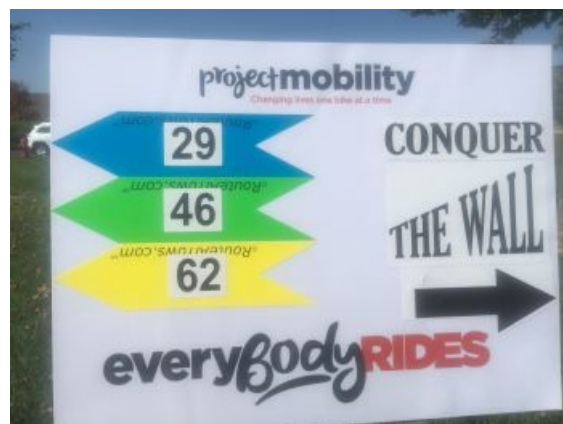
Many riders were up tp the challenge!