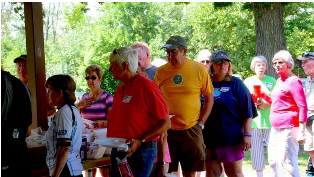
EBCers socialize while in the food line.