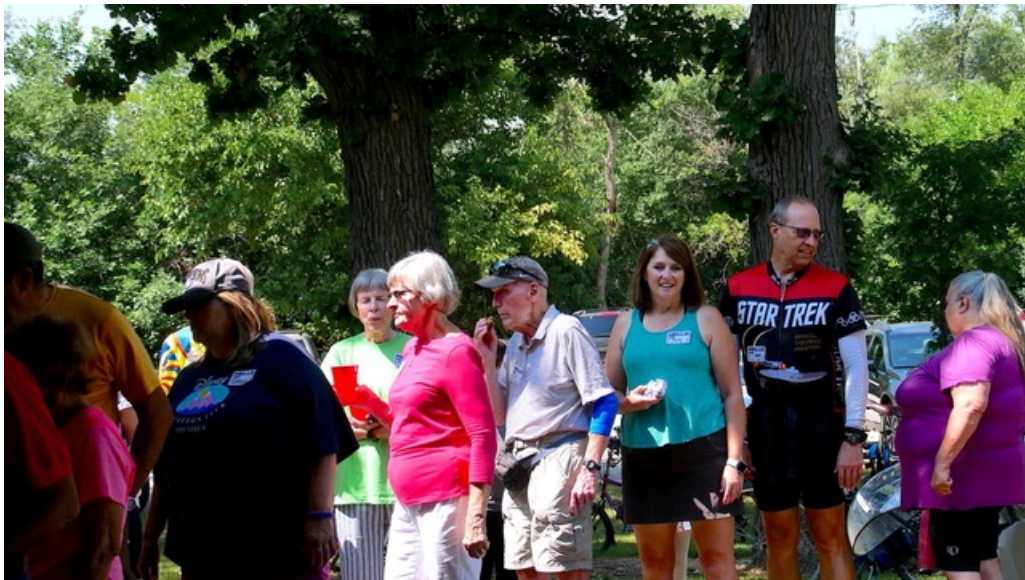
EBCers socialize while in the food line.