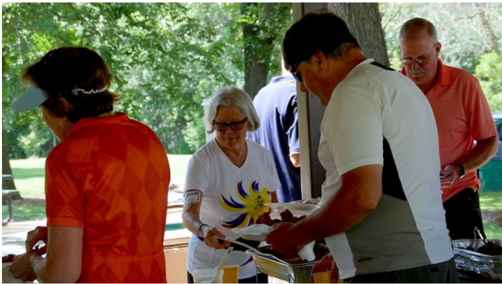
EBCers socialize while in the food line.