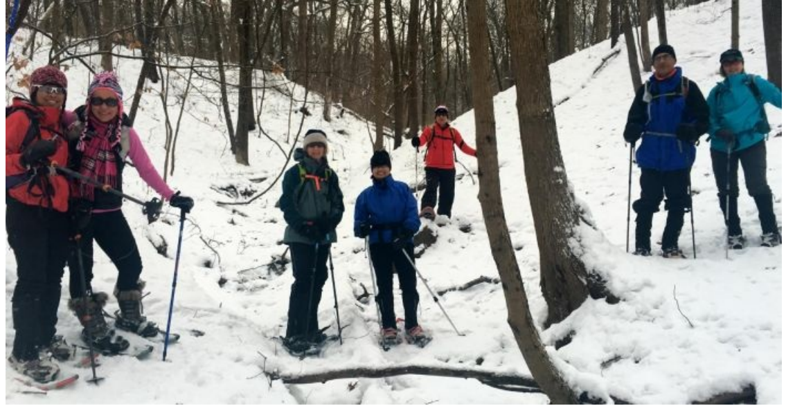
The Ravine is just the challenge they are looking for.