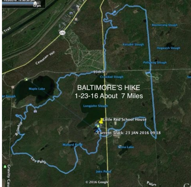
When you are ready to tackle the hike for yourself!