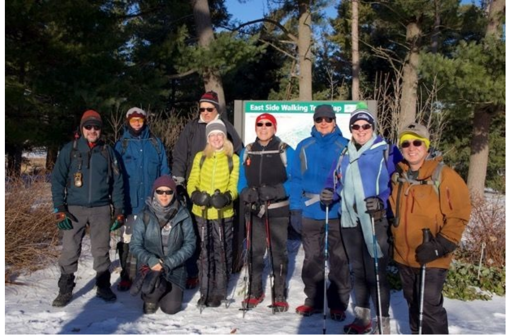
The Arboretum calls out to our members!