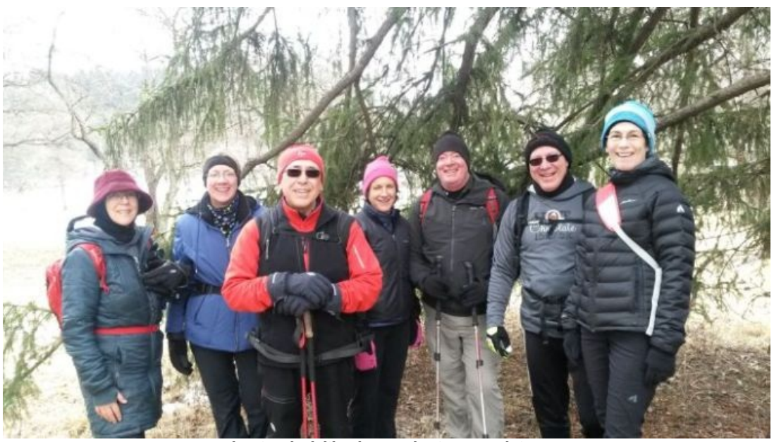
They just look like they are having a good time!

9 members + 2 shadows = 11 cheerful hikers enjoying the sunshine Here is another weekend of hiking: