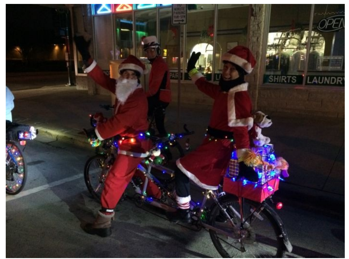
Santas in abundance!