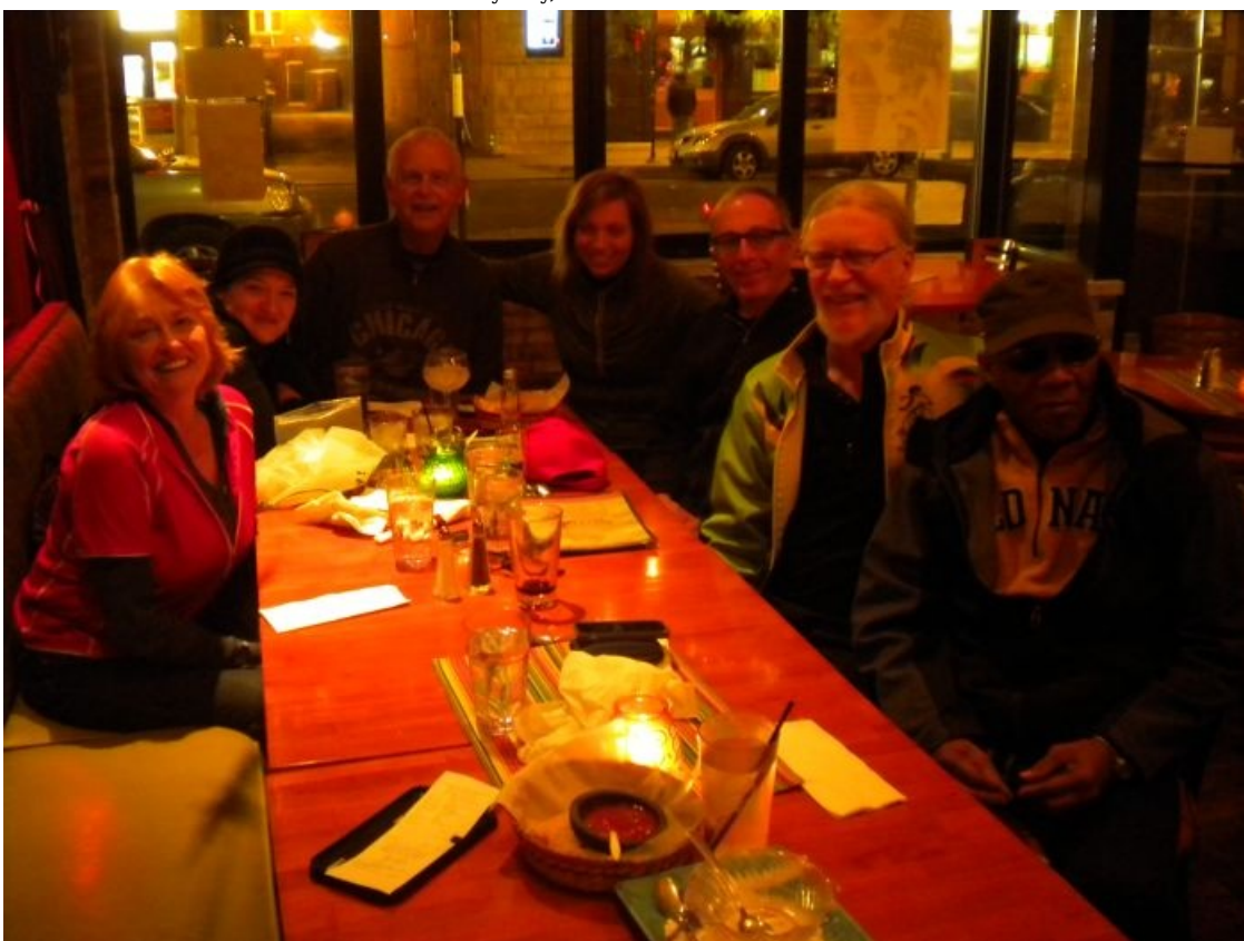
I think I see a Margarita on that table somewhere.