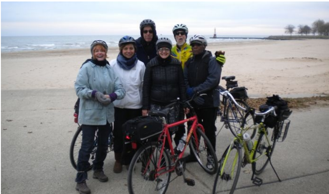
A Frosty Day, Lakeside. EBCers launch!