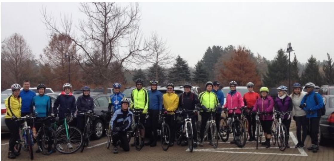
Quite a turnout for a cold Sunday in December!

I hope you would consider coming out this winter to give us a try.