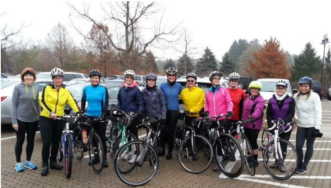
The Ladies of EBC Rock!