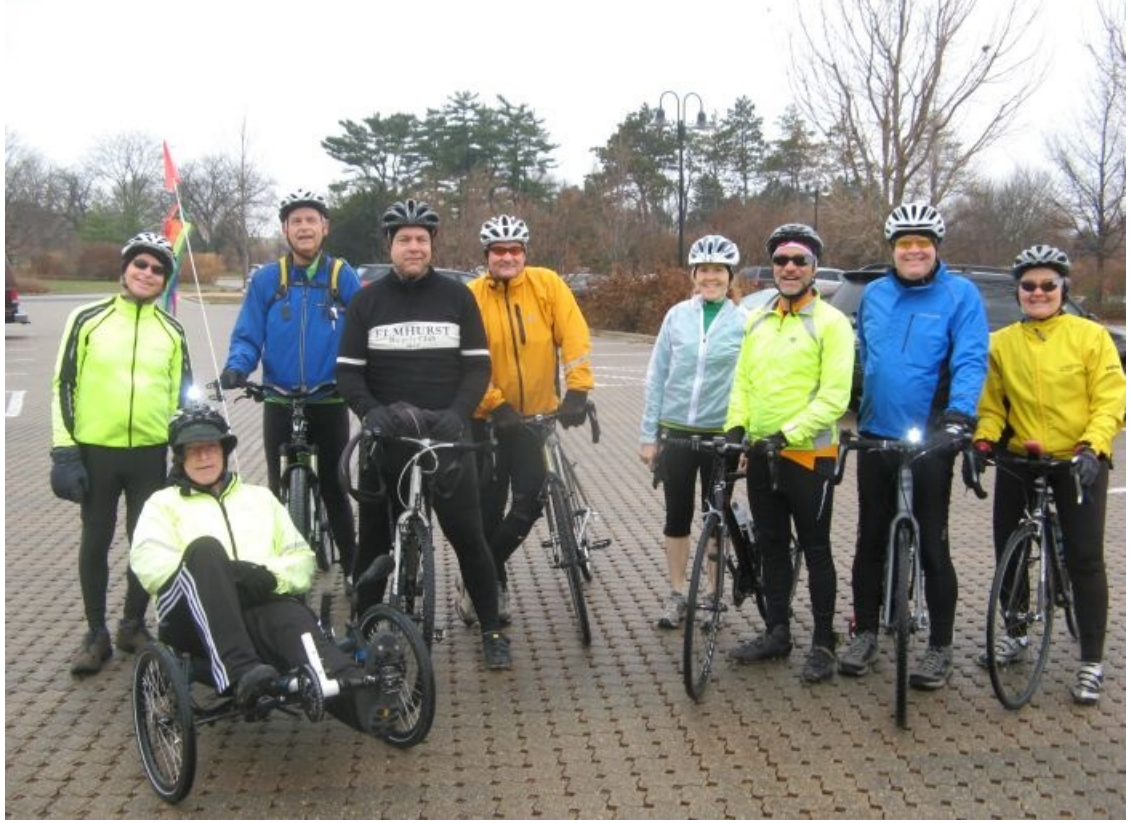
It was spritzing the weekend before Thanksgiving at the Morton Arboretum. But it didn't bother this crew!