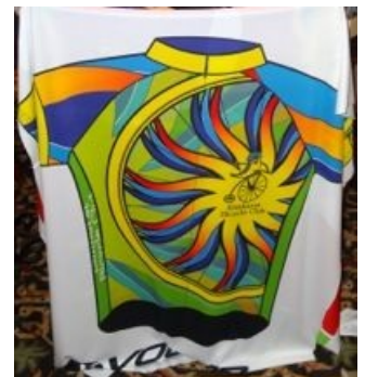
This is the jersey design of the current order.

If you are interested in an EBC jersey, just click on the link and follow the directions.