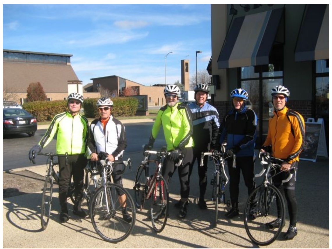
It was still above freezing this day. Some of us are not wearing a balaclava. Panera Bread, St. Charles, IL