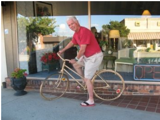
Waynesboro welcomes BRAG with vintage bicycles staged in town.

Each day's ride was typically about 60 miles (shortest was 49; longest was 78), but there was a 'hammerhead' option each day which added 10 or 20 miles to the route - if you were so inclined. On Wednesday, there was a century option for those who needed it and had acclimated to the heat. We had good weather all week long. It stormed one night but was dry in the morning and for the rest of the day. On the day of the century, an afternoon thunderstorm popped up. About 80 riders did the century including myself. I happened to be riding with a female active duty U.S.M.C. Major who was determined to ride the century even as the rain threatened. At the last rest stop, one of the SAG drivers encouraged us to sag in as it looked pretty dark up the road and we were the last two riders on the course, but the Major was determined to finish on her bike. We launched. About 4 miles ahead, the sag vehicle pulled ahead of us and stopped. The driver was holding a tablet computer with a real time display. He said, "you guys are going to get soaked." We took his advice and started to load our bikes on to his vehicle. Before we finished securing the bikes it began to sprinkle. In another 3 miles it began to rain seriously. And then all hell broke loose with thunder and lightning and sideways rain.