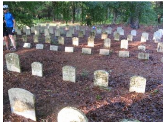
Headstones tell some interesting tales.