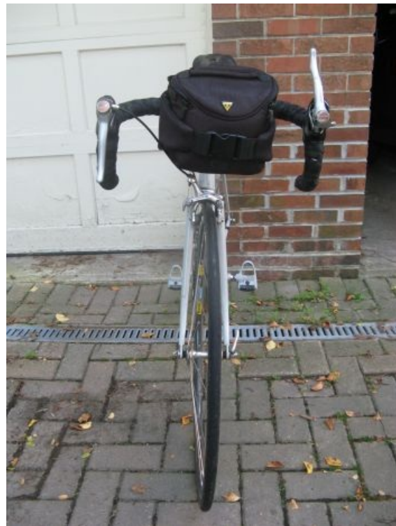
What's wrong with this picture?

Finally, one maintenance story .... At the last rest stop on the 5th day, as I moved my bike away from a wall against which it was resting, I noticed that the front wheel was dragging. The brake calipers were pinching the wheel. Now why would that be? I then looked at the left hand brake lever and noticed it seemed to be loose. As I touched the lever, it came off in my hand. Now I can't be sure what caused this, but I will tell you that the route maps each day would point out sections of the road which they called "shake and bake." This never amounted to more than a mile or two stretch, and it just wasn't all that bad. Surely, not like the cobbles on this year's Tour. But I suspect that the vibration from the shake and bake caused a nut to come loose which holds the lever to the rest of the brake assembly. I was able to open the calipers via the quick release and road the bike the remaining 20 miles for that day's ride. As is customary on these sorts of rides, a bike maintenance shop accompanied us each day and set up shop at the end of each day. I brought them my bike looking for an inexpensive fix, but the best they could do for me was $279 for a pair of new STI brake-shifters. I declined their offer and they gave me all my parts back. As I studied the broken lever, I came upon a solution -- yes a little unconventional -- that got me through the next 2 days with a brake lever that actually applied the front brakes when I pushed it.