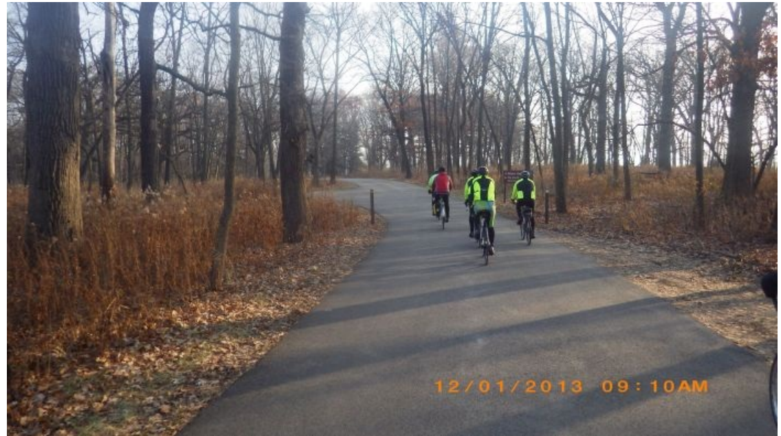
Quiet, inviting roads loop through the east and west sides of the Arboretum.