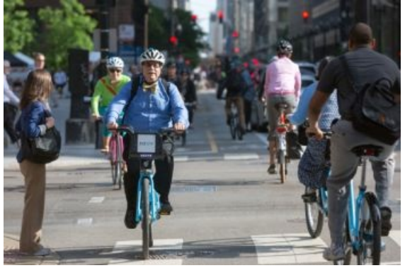
Dearborn St., Chicago, the protected bike lane. Notice the Divvy bikes?

The peopleforbikes organization had this to say, "Chicago's 1.2-mile showpiece isn't the country's most sophisticated downtown bikeway because of its on-street markings, though they're excellent, or its quick-and-simple plastic-post barriers. The really remarkable thing about Dearborn is that bikes get their own traffic signals. Maybe that's why stoplight compliance has soared from 31 percent to 81 percent and bike traffic has more than doubled since the lane went in. Did we mention that one of its local fans has given the lane its own Twitter feed? We challenge any other street project in the country to inspire such devotion."