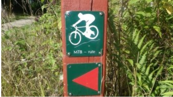
I think it says 'follow the yellow dirt road.