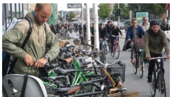
The Danes are into bicycling in a big way.

http://albums.phanfare.com/slideshow.aspx?i=1&db=1&pw=ZjtfsrYW&a id=5743070