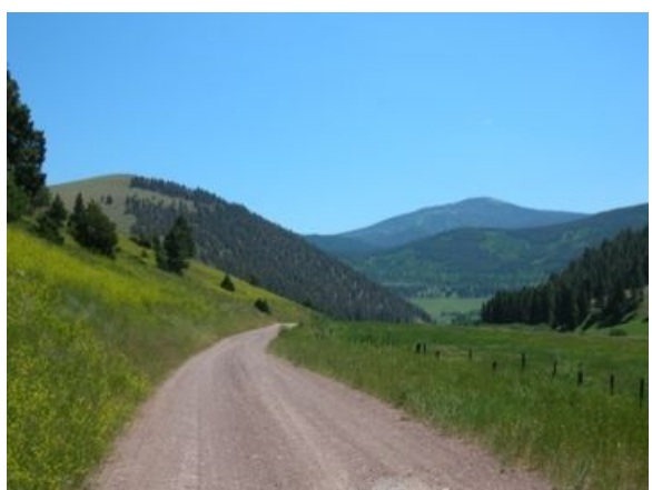
Montana trail climbs up the mountain!

and push them up the very steep grades, but the wheels did not roll well over the rocky litter. Pushing was exhausting work for me. Next time, I would work on my upper body strength. Coming down the mountain was easier. My steel bike, with its two-inch wide tires, rolled like a tank over rocks, ruts and potholes, and when the dirt roads were good, it was a lot of fun.