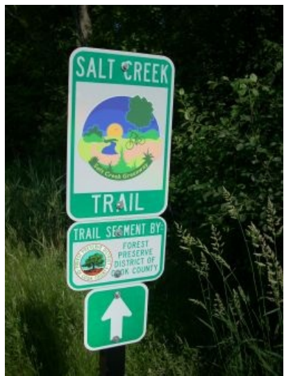
Bemis Woods at Wolf Road

I had heard of this trail and had recently seen a sign or 2, but had not ridden this trail. Some of you may be in the same boat even though you have been riding trails around Elmhurst for many years. In some years, even fairly recently, you couldn't have done this entire trail because it did not completely exist. But there has been