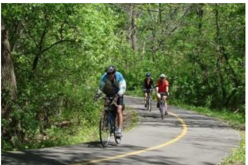
North Branch Trail

There is no charge for bicyclists to enter the Gardens. There is a parking fee for vehicles; however Morton Arboretum members enjoy reciprocal entry privileges.