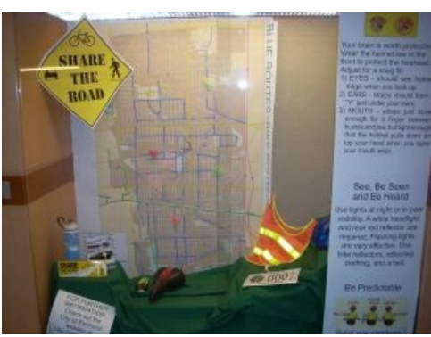
Elmhurst Library 1st Floor

Speaking of the new Trail, some of you attended the open house sessions conducted by the Elmhurst Park District. Though the District had done its homework and come up with options acceptable to some residents, it was clear at the sessions that not all residents agreed. The residents finally put forth the idea that the bike traffic would be best distributed across 4 streets from Madison to the Prairie Path, exactly what we have been doing for the past two years. Another meeting will be held with the Citizens' Advisory Group before a final recommendation will be made to the District Board. The alternative to a completion