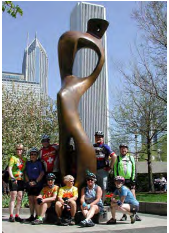
A stop at the Chicago Art Museum while viewing tulips on Michigan Ave.