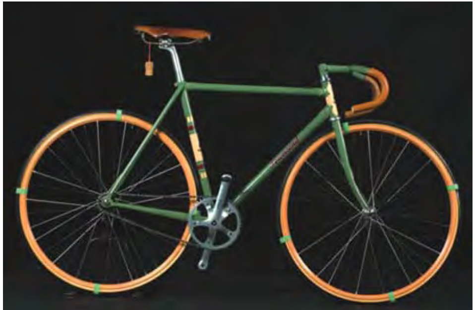
Townsend Track Bike

– online and in person – for frame-builders and consumers looking for custom-made bikes, for the sharing of ideas and promotion of this industry and its traditions. After three years of growing by leaps and bounds, NAHBS 2008 will feature still more exhibitors, consumers and a wealth of seminars. For more information, see http://www.handmadebicycles-how.com .