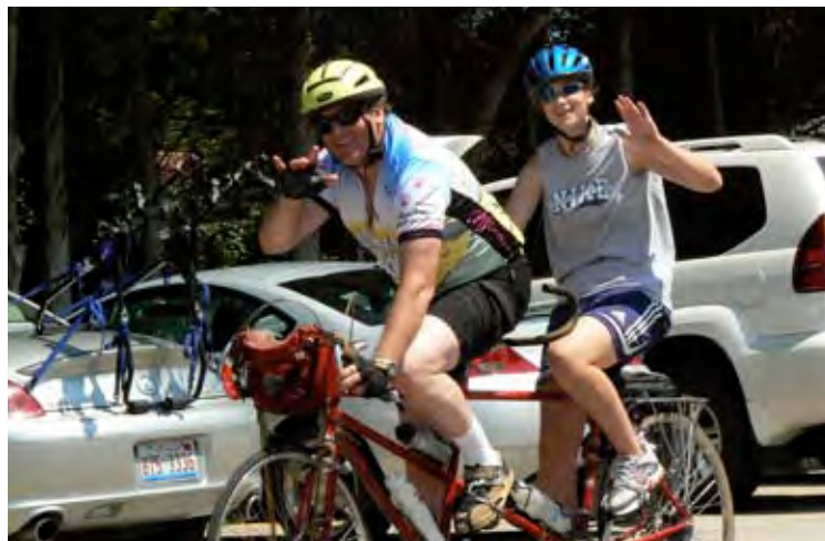
Many exhausted but happy, Metro Metric riders. Also, no corny photos of our fearless president.