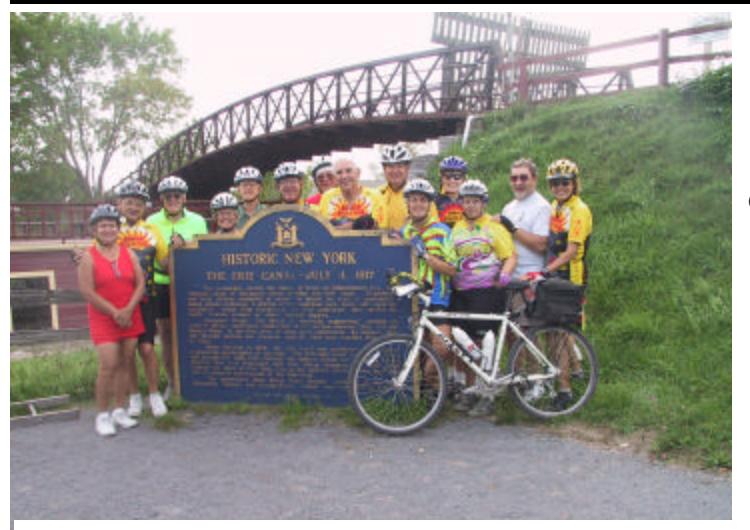
The EBC Erie Canal tour group poses with a sign commemorating the start of the canal construction. Story on Page 3.